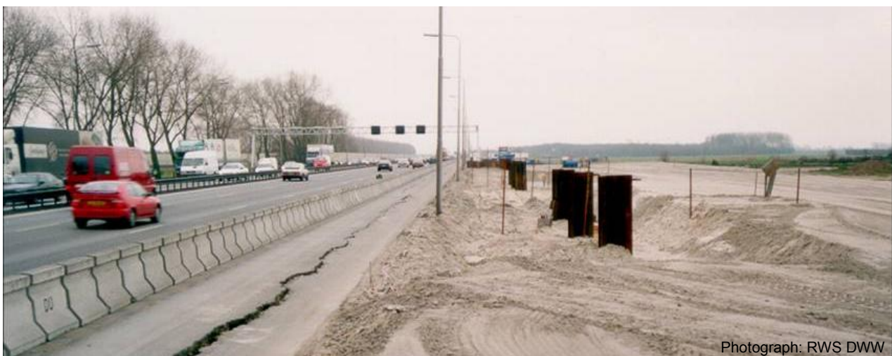
Figure 2 - Pavement cracking at road widening project

Construction of embankments on these weak and compressible soils cannot be controlled without due attention for the short term and long-term behaviour. Embankment raising should proceed at a rate sufficiently slow to allow the increase of bearing capacity during consolidation, and prevent slope failure. Soil improvement or soil reinforcement will be required in most cases to speed up the settlement process and minimize differential settlements after completion of the road. Differential settlements will become apparent at transitions to piled structures and at the transitions between existing and new embankments built to accommodate road widenings (Figure 2).